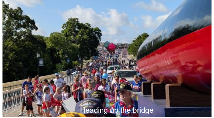
Heading up the bridge