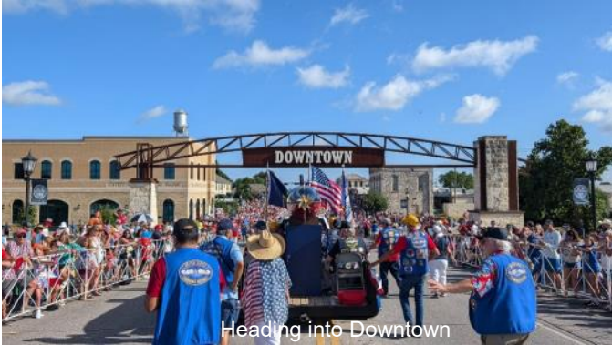
Heading into Downtown