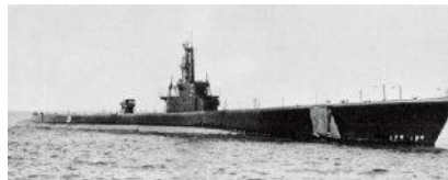
USS Kete (SS-369)

Lost on March 20, 1945 with the loss of 87 officers and men at the end of her 2nd war patrol. Probably sunk near Okinawa, by a Japanese submarine that itself was subsequently lost.