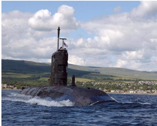
UK Royal Navy Submarine