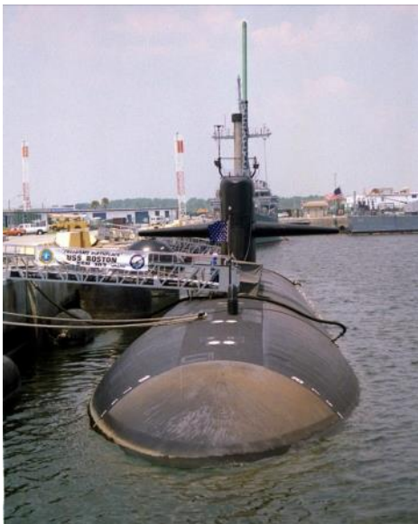
A bow view of the nuclear-powered attack submarine Boston (SSN-703) moored at a pier at NAS Mayport Florida on 1 August 1998..