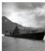
USS Triton (SS-201)

Lost on March 15, 1943 with the loss of 74 men. She was sunk north of the Admiralty Islands during a fight with 3 Japanese Destroyers. Triton was the 1st boat to engage the enemy in December 1941 off Wake Island, sinking 9 ships, 1 submarine and a destroyer.