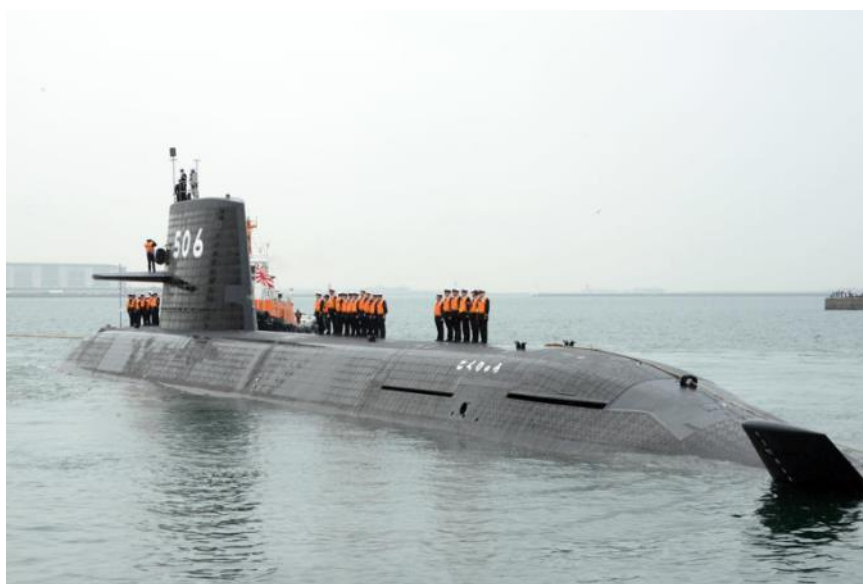
Japan is building a larger submarine fleet but it is still only about a third the size of China's. This image shows the Sōryū-class submarine Kokuryū.

Consequently, Japan needs to both increase the size of its submarine fleet, and equip each sub with advanced technologies to achieve a qualitative advantage.