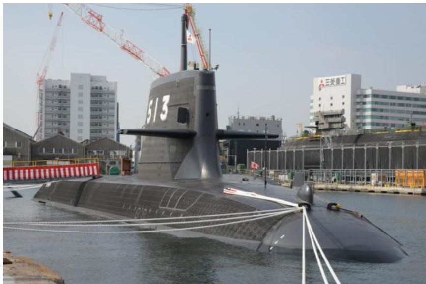
Japan has built one Taigei-class attack submarine every year since 2020. The lead ship seen here was commissioned in 2022.

Japan's 'Big Whale' submarines add another weapon to bottle up China's navy (msn.com)