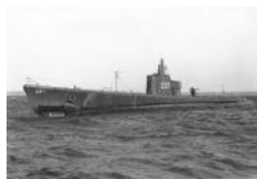
USS Grampus (SS-207)

Lost on March 5, 1943 with the loss of 71 officers and men, on her 6th war patrol. She was lost in Vella Gulf, sunk after engaging 2 Japanese Destroyers. In company with USS Grayback, Grampus departed Brisbane, Australia on her 6th war patrol from which she failed to return, the manner of her loss still remains a mystery today.