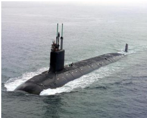
USS Virginia, lead ship in the current class of fast attack submarines. WIKIPEDIA

The threat of a Chinese amphibious assault against Taiwan is the central driver of U.S. defense strategy. If such an assault were to be successful, it would confirm China's status as the dominant military power in the Western Pacific.