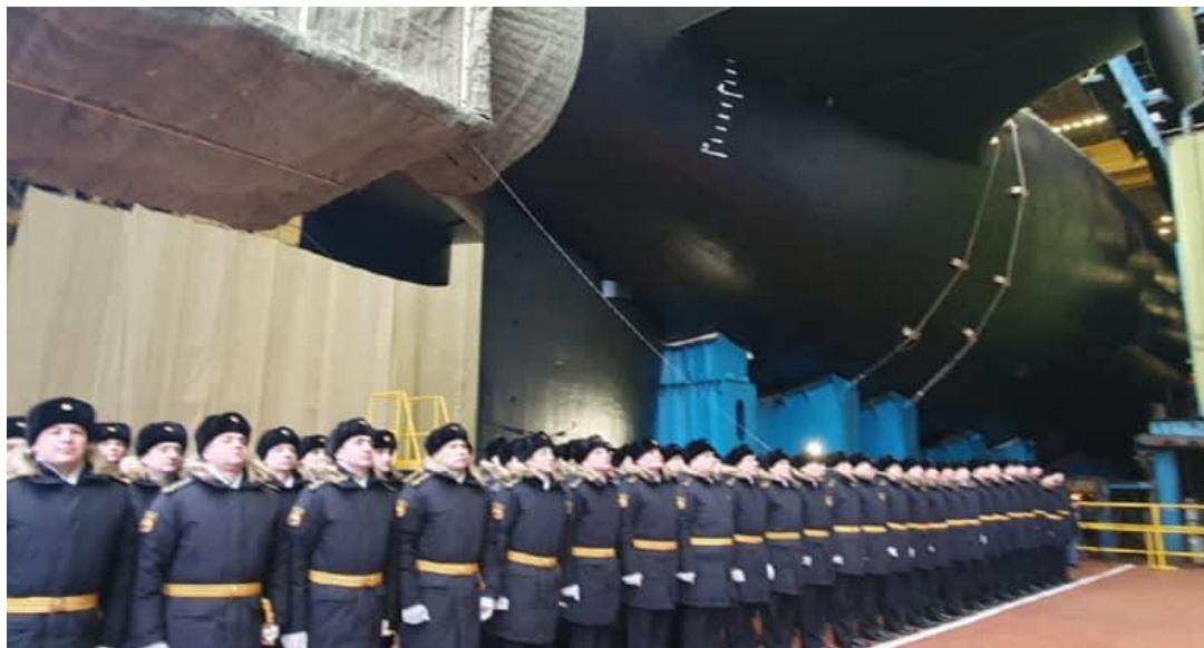
Roll-out of Knyaz' Pozharskiy at Sevmash shipyard. Note the covered pump-jet propulsor.

https://www.navalnews.com/naval-news/2024/02/russia-rolled-out-the-new-ssbn-borei-a-class/