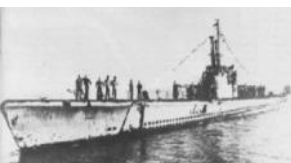
USS Trigger (SS-237)

Lost on March 26, 1945 with the loss of 89 officers and men, on her 12th war patrol. She was lost during a combined attack by Japanese antisubmarine vessels and aircraft. Trigger ranked 7th in total tonnage sunk and tied for 8th in number of ships sunk.