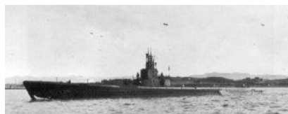
USS Tullibee (SS-284)

Lost on March 26, 1944 with the loss of 79 officers and men, on her 4th war patrol. It's believed she was a victim of a circular run by one of her own torpedoes. The lookout was the only survivor and he survived the war as a Japanese prisoner.