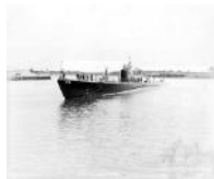
USS Perch (SS-176)

Lost on March 3, 1942 near Java with no immediate loss of life, while on her 1st war patrol. She survived 2 severe depth chargings in less than 200 feet of water by 3 Japanese destroyers. The crew abandoned ship and scuttled her. Of the 61 officers and men taken prisoner, 55 survived the war and six died as POWs.