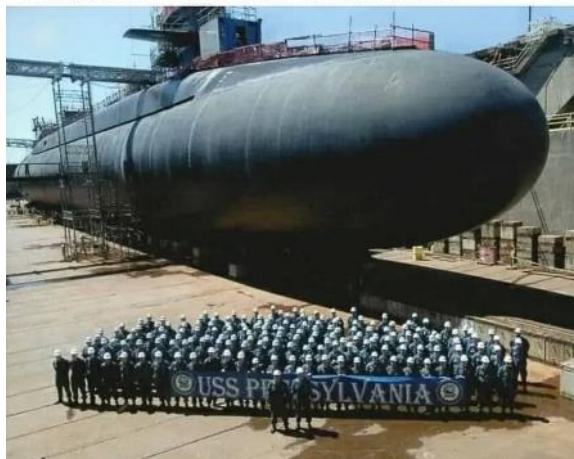
A little perspective as to the size of a modern submarine.