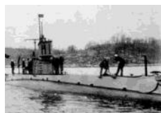
USS H-1 (SS-28)

Lost on March 12, 1920 with the loss of 4 men as they tried to swim to shore after grounding on a shoal off Santa Margarita Island, off the coast of Baja California, Mexico. Vestal (AR-4), pulled H-1 off the rocks in the morning of 24 March, only to have her sink 45 minutes later in some 50 feet of water. She was originally named the USS Seawolf before becoming H-1.