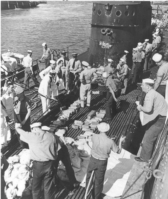
Unloading gold bars from USS Trout, at Pearl Harbor, March 1942