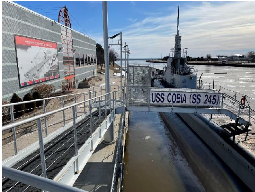
USS Cobia Submarine docked in Manitowoc, March 8, 2023

MANITOWOC, Wis. (WLUK) -- A grand bash for a Lakeshore favorite is in the works.