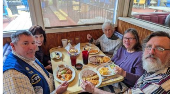
Repp's and Keller's