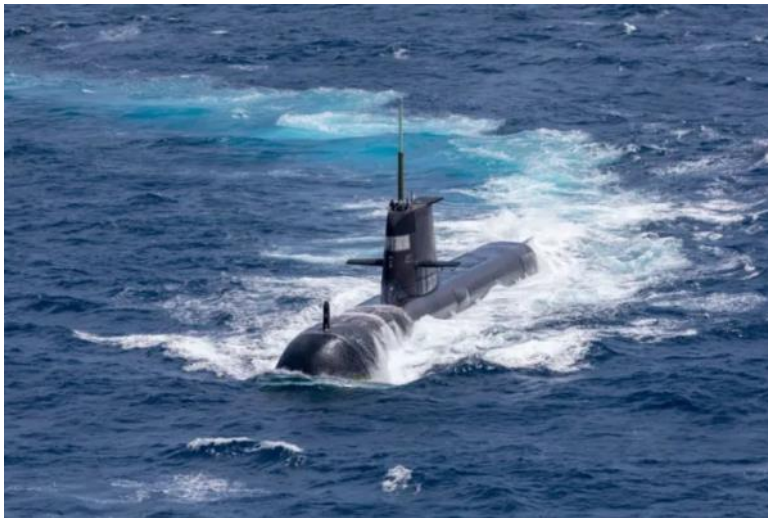
An Australian submarine.

Australia is expected to buy up to five submarines from the United States as part of a new defense agreement, Reuters reported Wednesday.